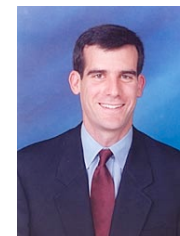
ERIC GARCETTI Council President